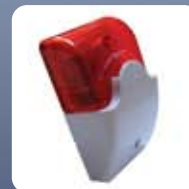
SIREN & STROBE