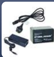
BATTERY BACK UP